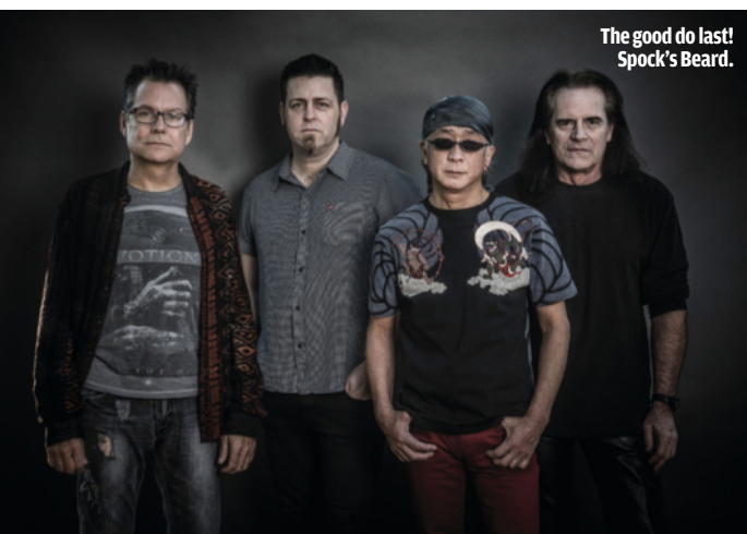
The good do last! Spock's Beard.