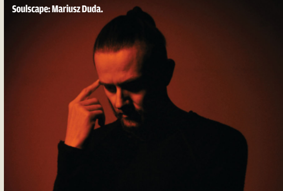
Soulscape: Mariusz Duda.

King Crimson are giving fans the chance to relive their 2016 concert in the Austrian capital. Live In Vienna, 2016 is out on April 6 via Panegyric, and includes the live recorded debut of Fracture by their 2016 line-up in Copenhagen. The three-CD set also includes newly sequenced soundscapes drawn from the improvised introduction music with performances from Robert Fripp, Mel Collins and Tony Levin. King Crimson return to the UK in October.